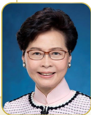
The Hon Mrs Carrie Lam Cheng Yuet-ngor, GBM, GBS 林鄭月娥女士, 大紫荊勳賢, GBS

The Chief Executive of the Hong Kong Special Administrative Region 香港特別行政區行政長官