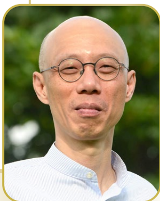
Mr Wong Kam-sing, GBS, JP 黃錦星先生, GBS, 太平紳士

Secretary for the Environment, Hong Kong Special Administrative Region 香港特別行政區環境局局長